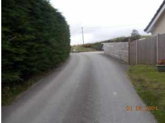
Plate 3: a section of the current farm access track on the northern part of the site. Photograph taken from the north.

Buildings: There are eight operational poultry sheds on the site (see Figure 2 and Plates 4 – 6). These sheds will be demolished and replaced with more efficient buildings. All of the sheds were judged to have negligible potential to support roosting bats as no potential bat roosting features were observed. There are several other buildings on the site including a residential property (a bungalow) and several small huts and ancillary buildings. All of the buildings will remain undamaged and in situ during the project and were therefore not assessed for their potential to support roosting bats (refer also to the section on Bats below).