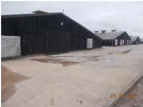
Plate 4: a view of the poultry sheds on the site. All of the poultry sheds were judged to have negligible potential to support roosting bats. They will be demolished and replaced with more efficient buildings.

Buildings: There are eight operational poultry sheds on the site (see Figure 2 and Plates 4 – 6). These sheds will be demolished and replaced with more efficient buildings. All of the sheds were judged to have negligible potential to support roosting bats as no potential bat roosting features were observed. There are several other buildings on the site including a residential property (a bungalow) and several small huts and ancillary buildings. All of the buildings will remain undamaged and in situ during the project and were therefore not assessed for their potential to support roosting bats (refer also to the section on Bats below).