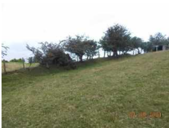
Plate 12: a view of the defunct hedgerow (H2) on a section of the site's southern boundary. Photograph taken from the north. This hedgerow has been assessed according to the Hedgerows Regulations, 1997 as 'not important'. It has also been judged to have negligible potential to support roosting bats. All of this hedgerow will remain undamaged and in situ during the project.

Defunct Native Species-rich Hedge : This hedgerow (Hedgerow 2 (H2)) is found on sections of the site's southern boundary (see Figure 2 and Plate 12). The woody species present in this hedge include blackthorn, goat willow, gorse, hawthorn, hazel, holly, rowan and silver birch. Plant species recorded in the hedge are shown in Table 1 in Appendix 1 under the column heading 'Hedgerow 2'. They include only widespread and common species. This hedge has been assessed as 'not important' according to the Hedgerows Regulations, 1997 (see Table 3 in Appendix 1). It has been judged to have negligible potential to support roosting bats as no bat roosting features were observed. All of this hedgerow will remain undamaged and in situ during the project.