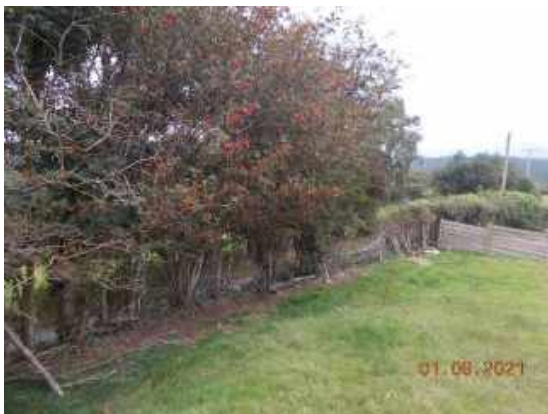
Plate 15: a view of the Hedgerow 5 (H5) on part of the site's northern boundary. Photograph taken from the south-west. This hedgerow has been assessed according to the Hedgerows Regulations, 1997 as 'not important'. It has also been judged to have negligible potential to support roosting bats. All of this hedgerow will remain undamaged and in situ during the project.

The hedgerow on part of the site's northern boundary (Hedgerow 5 (H5), see Plate 15) is approximately 2 - 12m in height and 1.5m in width at the base, with a bank (c1.5m high). The woody species present in this hedge include elder, hawthorn, holly, rowan, sycamore and field rose. Plant species recorded in the hedge are shown in Table 1 in Appendix 1 under the column heading 'Hedgerow 5'. They include only widespread and common species. This hedge has been assessed as 'not important' according to the Hedgerows Regulations, 1997 (see Table 6 in Appendix 1). It has been judged to have negligible potential to support roosting bats as no bat roosting features were observed. All of this hedgerow will remain undamaged and in situ during the project.