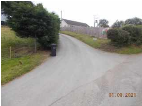
Plate 2: the junction of the existing farm access track and the highway. Photograph taken from the north-east.

Access to the Site: The project will use the existing farm access track (see Plates 1, 2 and 3) which joins the highway to the north of the site. The current access track consists of hardstanding along its full length.