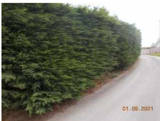
Plate 11: a view of Hedgerow 1 (H1) in the northern part of the site bordering the access track. Photograph taken from the north. This hedgerow has been assessed according to the Hedgerows Regulations, 1997 as 'not important'. It has also been judged to have negligible potential to support roosting bats. All of this hedgerow will remain undamaged and in situ during the project.

Intact Species-poor Hedge : This hedgerow (Hedgerow 1 (H1)) is found in the northern part of the site bordering the access track (see Figure 2 and Plate 11). The hedgerow is approximately 6m in height and 4m in width at the base. The only woody species present in this hedge is Leyland cypress. Plant species recorded in the hedge are shown in Table 1 in Appendix 1 under the column heading 'Hedgerow 1'. They include only widespread and common species. This hedge has been assessed as 'not important' according to the Hedgerows Regulations, 1997 (see Table 2 in Appendix 1). It has been judged to have negligible potential to support roosting bats as no bat roosting features were observed. All of this hedgerow will remain undamaged and in situ during the project.