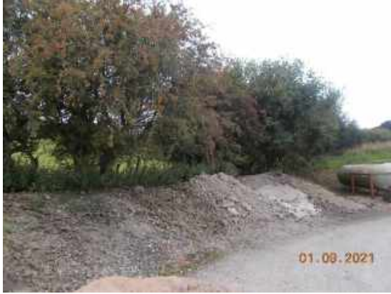
Plate 14: a view of the Hedgerow 4 (H4) on the central part of the site's southern boundary. Photograph taken from the north-east. This hedgerow has been assessed according to the Hedgerows Regulations, 1997 as 'not important'. It has also been judged to have negligible potential to support roosting bats. All of this hedgerow will remain undamaged and in situ during the project.

The hedgerow on part of the site's northern boundary (Hedgerow 5 (H5), see Plate 15) is approximately 2 - 12m in height and 1.5m in width at the base, with a bank (c1.5m high). The woody species present in this hedge include elder, hawthorn, holly, rowan, sycamore and field rose. Plant species recorded in the hedge are shown in Table 1 in Appendix 1 under the column heading 'Hedgerow 5'. They include only widespread and common species. This hedge has been assessed as 'not important' according to the Hedgerows Regulations, 1997 (see Table 6 in Appendix 1). It has been judged to have negligible potential to support roosting bats as no bat roosting features were observed. All of this hedgerow will remain undamaged and in situ during the project.