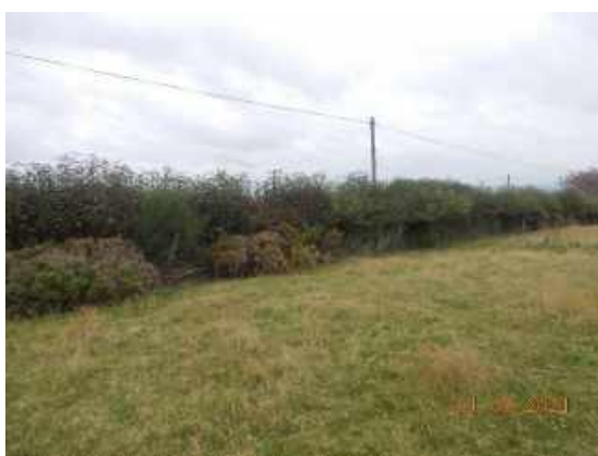
Plate 13: a view of the Hedgerow 3 (H3) on the site's eastern boundary. Photograph taken from the north. This hedgerow has been assessed according to the Hedgerows Regulations, 1997 as 'important'. It has also been judged to have negligible potential to support roosting bats. All of this hedgerow will remain undamaged and in situ during the project.

The hedgerow on the site's eastern boundary (Hedgerow 3 (H3), see Plate 13) is approximately 2 - 4m in height and 2m in width at the base, with a bank (c0.5m high). The woody species present in this hedge include broom, gorse, hawthorn, holly, rowan, sessile oak, yew and field rose. Plant species recorded in the hedge are shown in Table 1 in Appendix 1 under the column heading 'Hedgerow 3'. They include only widespread and common species. This hedge has been assessed as 'important' according to the Hedgerows Regulations, 1997 (see Table 4 in Appendix 1). It has been judged to have negligible potential to support roosting bats as no bat roosting features were observed. All of this hedgerow will remain undamaged and in situ during the project.