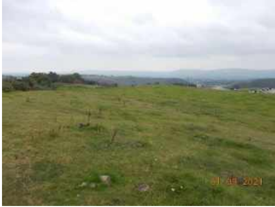
Plate 8: a view of the improved grassland on the western part of the site. Photograph taken from the south-west looking north. All of this habitat will remain undamaged and in situ during the project.

Tall Ruderal Herb: This habitat is present in the central part of the site and around the pond (see Figure 2 and Plate 9). Plant species recorded in this habitat are shown in Table 1 in Appendix 1. They include only widespread and common species.