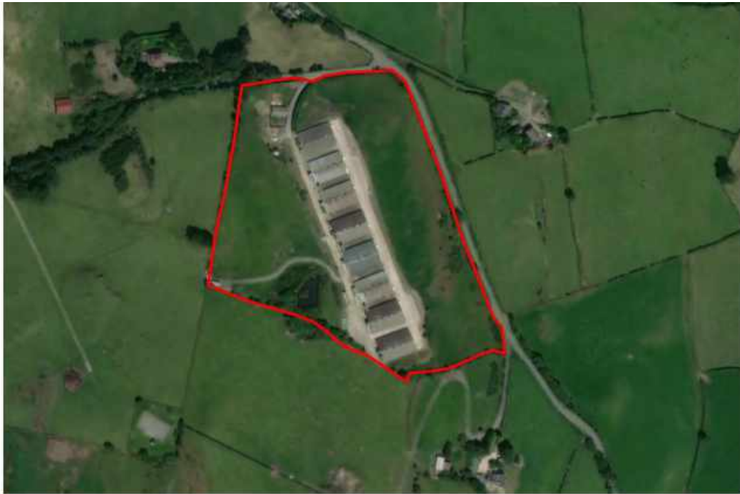
Plate 1: Aerial photograph of the site and surrounding land

Based upon Ordnance Survey ©Crown Copyright, under licence 1000058410, unauthorised reproduction infringes Crown Copyright and may lead to prosecution or civil proceedings.