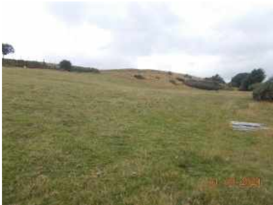
Plate 7: a view of the improved grassland on the eastern part of the site. Photograph taken from the south-east looking north. All of this habitat will remain undamaged and in situ during the project.

Improved Grassland: This habitat is present on a majority of the site surrounding the poultry unit (see Figure 2 and Plates 7 and 8). Plant species recorded in the grassland are shown in Table 1 in Appendix 1. They include only widespread and common species. The grassland is heavily grazed by sheep. All of this habitat will remain undamaged and in situ during the project.