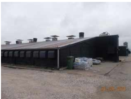
Plate 5: another view of a poultry shed on the site.