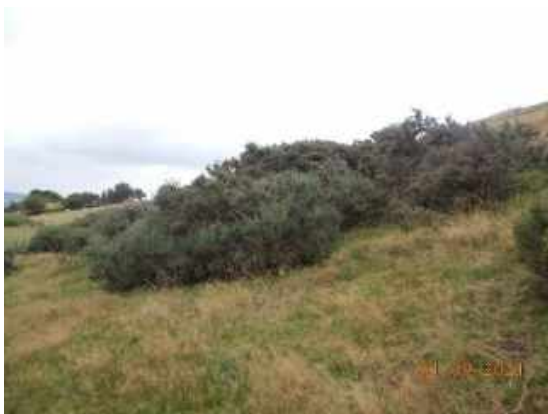
Plate 10: a view of one of the patches of gorse scrub on the site.

Dense, Continuous Scrub: This habitat is present as thick gorse scrub in small areas on the site (see Figure 2 and Plate 10). Plant species recorded in this scrub are shown in Table 1 in Appendix 1. They include only widespread and common species. All of this habitat will remain undamaged and in situ during the project.