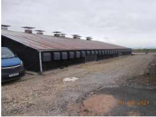
Plate 6: another view of a poultry shed on the site.

Amenity Grassland: This habitat is present in the northern part of the site associated with the garden of the bungalow (see Figure 2) and as a narrow road verge on the access track (too narrow to map on Figure 2, see Plate 2). Plant species recorded in the grassland are shown in Table 1 in Appendix 1. They include only widespread and common species. All of this habitat will remain undamaged and in situ during the project.