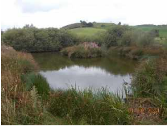
Plate 16: the pond located on the development site and assessed to have ‘poor’ habitat suitability for great crested newts. This pond will remain undamaged and in situ during the project.