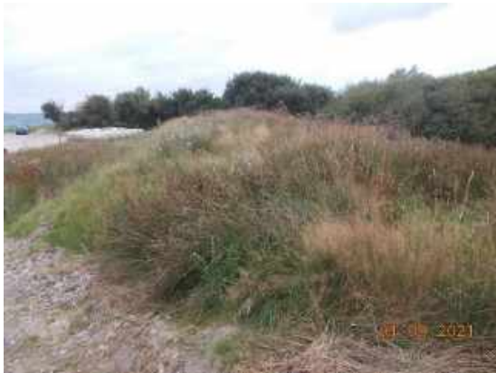
Plate 9: a view of the tall ruderal herb around the pond.

Tall Ruderal Herb: This habitat is present in the central part of the site and around the pond (see Figure 2 and Plate 9). Plant species recorded in this habitat are shown in Table 1 in Appendix 1. They include only widespread and common species.